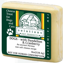
DOGH w/ Dandelion & Cranberry

Dandelion root is a natural diuretic and therefore is good for kidney and urinary tract health. Studies have also shown it to be incredibly detoxifying. Cranberry has been shown to help slough e.coli bacteria off the lining of the urinary tract. When using Solutions DOGH to support this Restorative Diet Solution, give up to 1/4th oz per 10lbs of body weight. Then reduce food use by 1/4th oz to assure proper daily caloric intake.