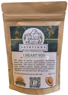
I Heart You

Dandelion root is a natural diuretic and therefore is good for kidney and urinary tract health. Studies have also shown it to be incredibly detoxifying. Cranberry has been shown to help slough e.coli bacteria off the lining of the urinary tract. When using Solutions DOGH to support this Restorative Diet Solution, give up to 1/4th oz per 10lbs of body weight. Then reduce food use by 1/4th oz to assure proper daily caloric intake.