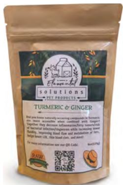
Turmeric & Ginger

The liver is continuously exposed to environmental chemicals, toxins, sometimes drugs, food contaminants, and more. The metabolism of some of these exposures may cause injury to the liver which can damage mitochondria and cells - potentially resulting in cancer or other diseases. Mitochondrial dysfunction is one of the major mechanisms of drug-induced liver necrosis, hepatitis, and liver failure. This blend contains Ashwagandha, Frankincense, Milk thistle, and other herbs that fight inflammation and increase the activity of cellular antioxidant enzymes.