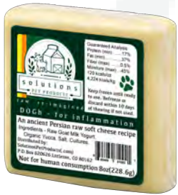
DOGh for Inflammation

This blend is designed to support heart health and fluid movement between the heart and kidneys. A reduction in heart function or health can make the body more susceptible to infection. This blend contains Gingko, which has the ability to increase oxygen saturation in the body and protect other organs from oxygen deprivation. Another ingredient Ginseng, has been found to be helpful in combatting mast cell cancer. There are other components of this blend that work to protect the body from pathogenic bacteria, increase minerals in the body, and fight chronic pain.