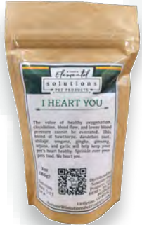
I Heart You

This blend is designed to support heart health and fluid movement between the heart and kidneys. A reduction in heart function or health can make the body more susceptible to infection. This blend contains Gingko, which has the ability to increase oxygen saturation in the body and protect other organs from oxygen deprivation. Another ingredient Ginseng, has been found to be helpful in combatting mast cell cancer. There are other components of this blend that work to protect the body from pathogenic bacteria, increase minerals in the body, and fight chronic pain.